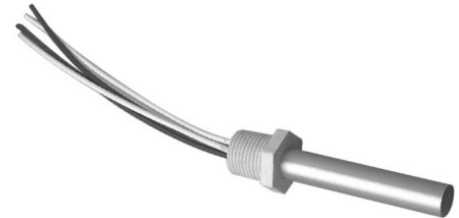
WP Series (DT-135WP, DT-200WP)